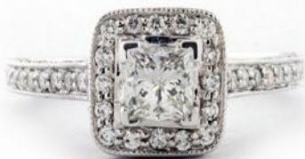
One (1) Lady's 18-Karat White Gold Diamond Engagement Ring